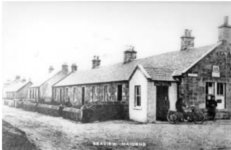
Seaview, Maidens ca 1910

I suppose the main reason for my turning a "Deaf Ear" to all these stories was due to the fact that every time my father (that's the one sitting on the floor) and his brothers got together at our house, I would hear stories about Maybole that made you think that Maybole was the Centre of the Universe. But since I found www.maybole.org I now know that all Minibolers believe this to be true!"